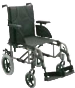
Available as either a standard Transit version or Transit HD.