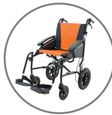
Transit version available