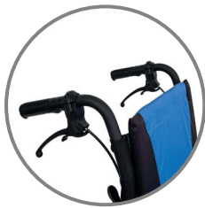
Easy to remove Attendant brakes