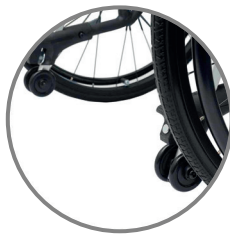
Anti-tip wheels as standard